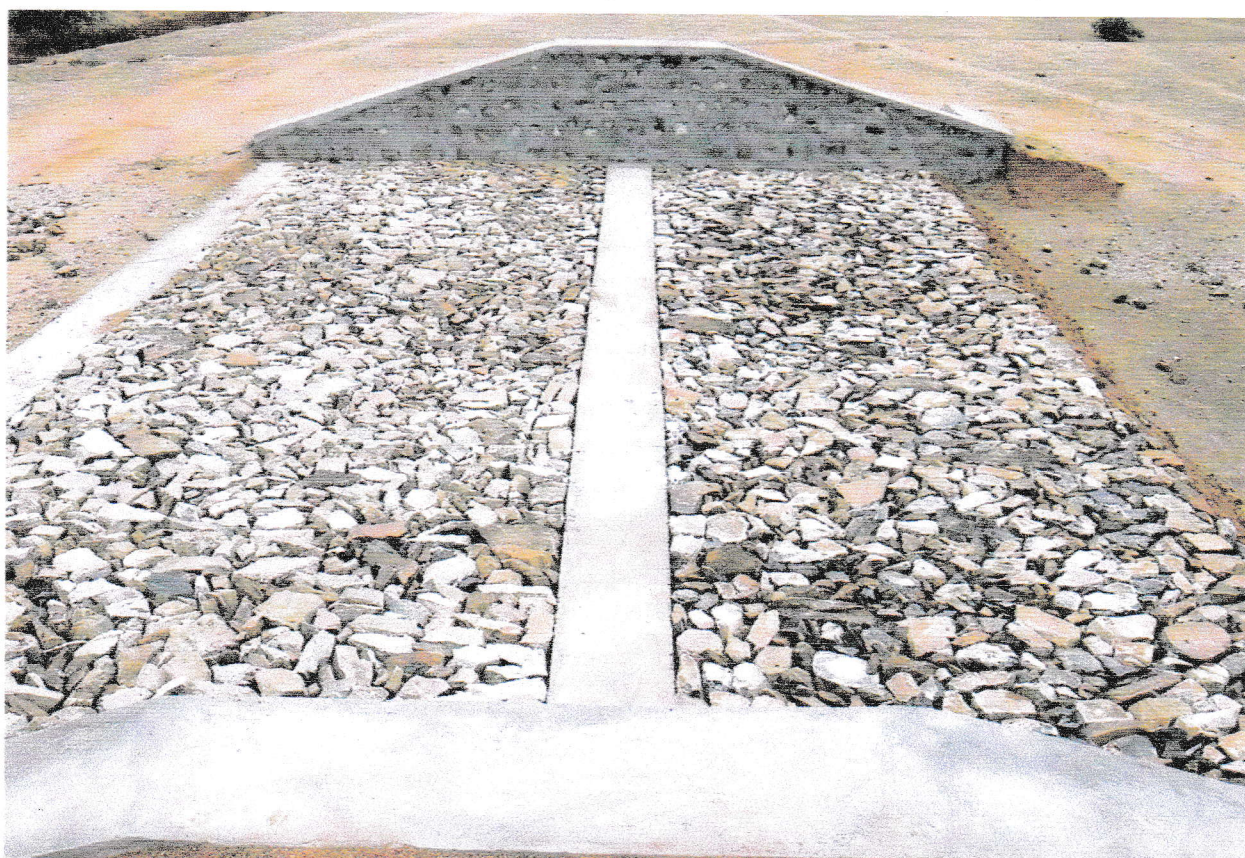
Fully repaired Flush Bar Type Waste Weir coping & D. R. Pitching.

:: Name of Work :: Special Repairs to Ex. Mal. Tank at ANJORA, Gat No. 21 Tah. Amgaon, Dist. Gondia