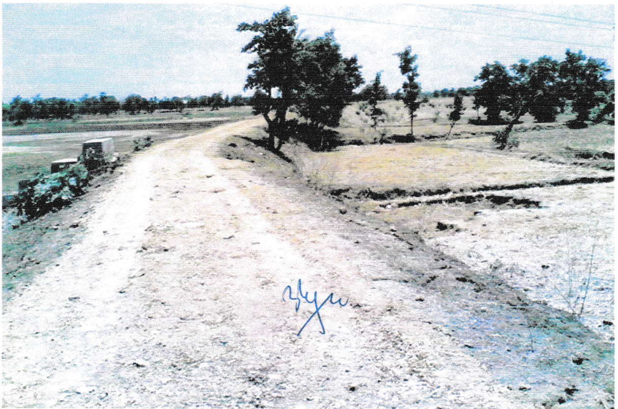
Murum Topping and Repair of Bund Line.

:: Name of Work :: Special Repairs to Ex. Mal. Tank at ASAITOLA (LATORI), Gat No. 50, Tah. Salekasa, Dist. Gondia