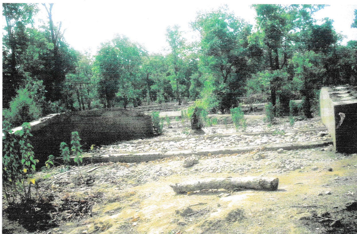
New construction of Flush Bar Type Waste Weir.

:: Name of Work :: Special Repairs to Ex. Mal. Tank at JAMDI Gat No. 237, Tah. Salekasa, Dist. Gondia