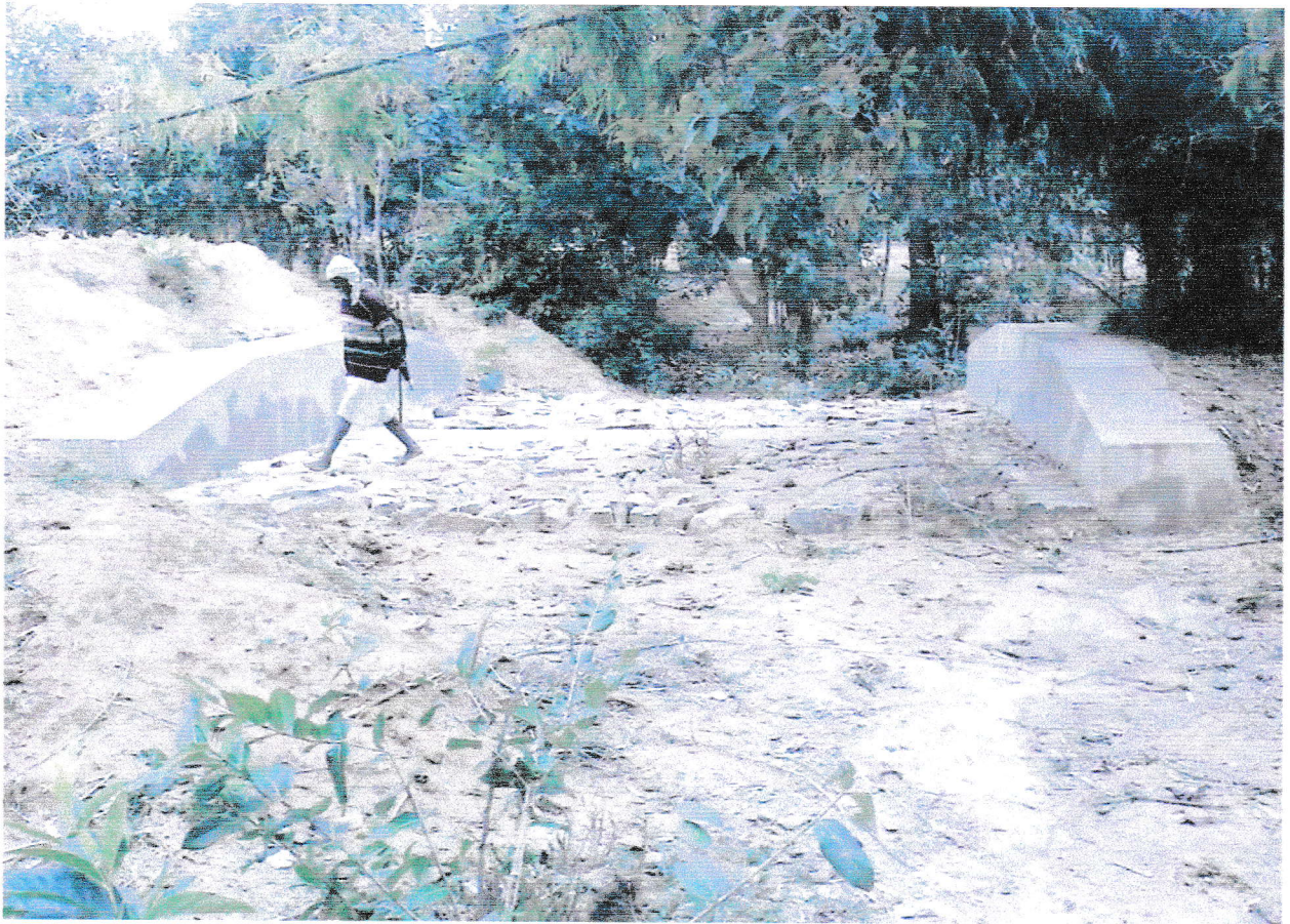
New construction of Flush Bar Type Waste Weir with D. R. Pitching.

Special Repairs to Ex. Mal. Tank at SONEKHARI , Gat No. 108 Tah. Amgaon, Dist. Gondia