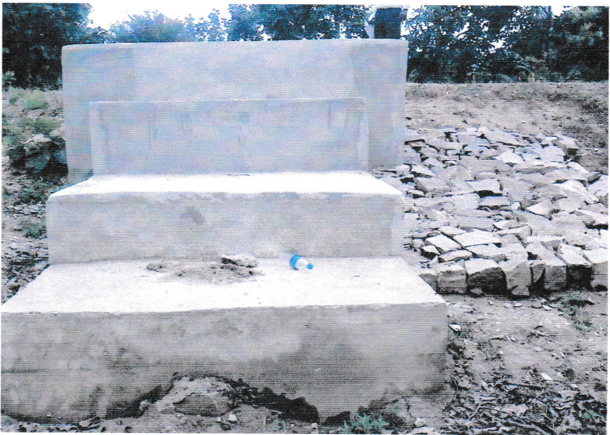
Newly constructed Plug Type H. R. at R. D. 10 Mtr. with D. R. Pitching.

Special Repairs to Ex. Mal. Tank at SONEKHARI , Gat No. 108 Tah. Amgaon, Dist. Gondia