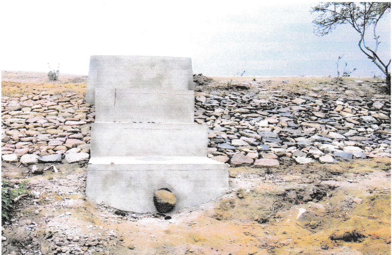
Newly constructed Plug Type H. R. at R.D. 140 Mtr. with D. R. Pitching.

:: Name of Work :: Special Repairs to Ex. Mal. Tank at ANJORA, Gat No. 21 Tah. Amgaon, Dist. Gondia