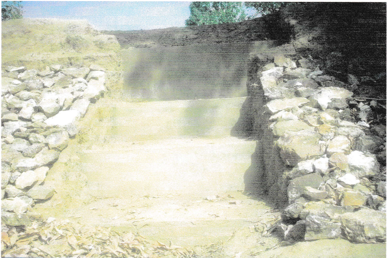
New constructed Plug Type Head Regulator at R. D. 260 Mtr.

:: Name of Work :: Special Repairs to Ex. Mal. Tank at JAMDI Gat No. 237, Tah. Salekasa, Dist. Gondia