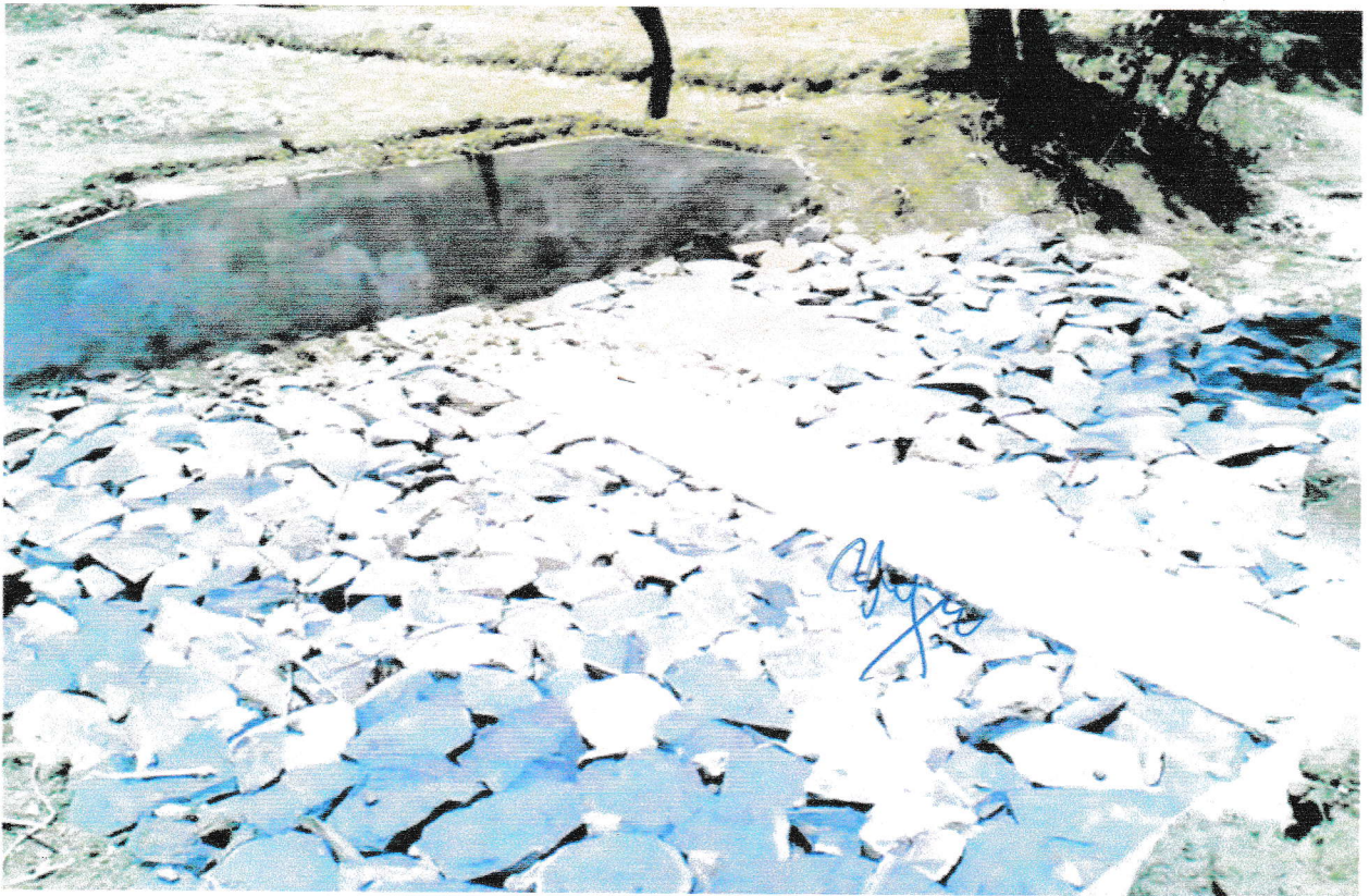
Newly construction of Flush Bar Type Waste Weir.

:: Name of Work :: Special Repairs to Ex. Mal. Tank at ASAITOLA (LATORI), Gat No. 50, Tah. Salekasa, Dist. Gondia