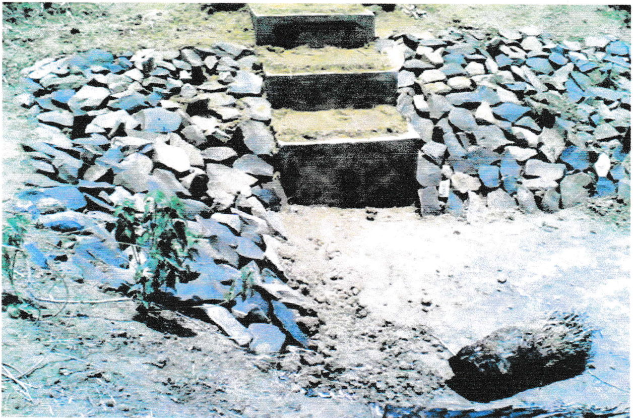
New constructed Head Regulator at R. D. 595 Mtr.

:: Name of Work :: Special Repairs to Ex. Mal. Tank at ASAITOLA (LATORI), Gat No. 50, Tah. Salekasa, Dist. Gondia